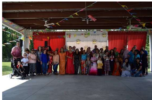
2017 Philippine Festival participants