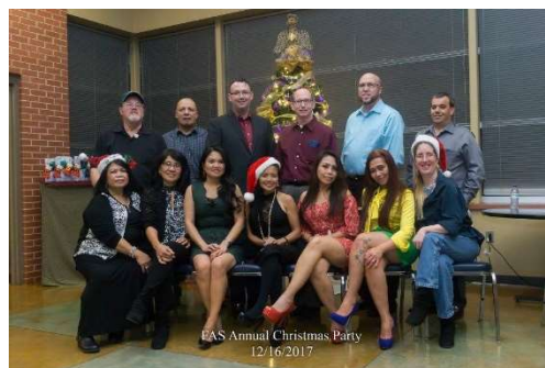
2017 Christmas Party; the FAS team after the event