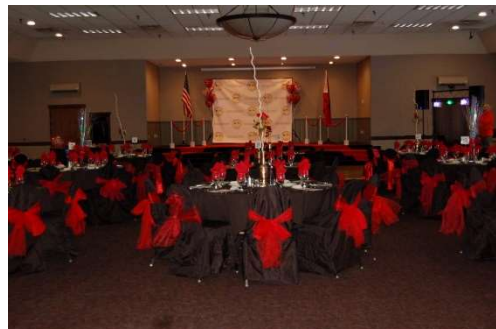
2018 Valentine's Ball; ready to go