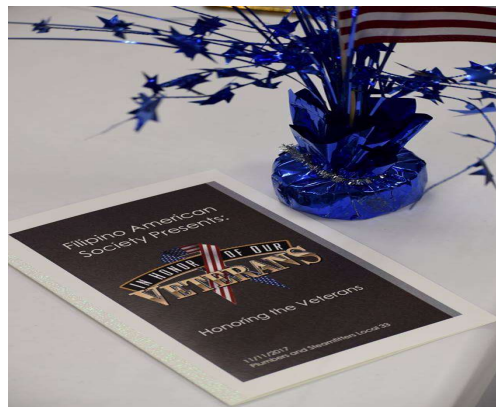
2017 Honoring the Veterans Program

The entire FAS team wants to send our thanks to the community, our friends, and our family for all of the support as we kick off another successful event year! Stayed tuned as we release these newsletters quarterly direct to the inbox of all of our associates!