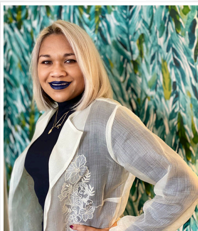
Roxy Strike Scholarship Program Committee