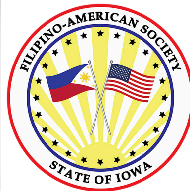
Vacant Scholarship Program Co-Chairman