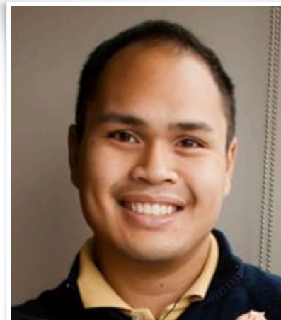
Farfum Ladroma Scholarship Program Committee